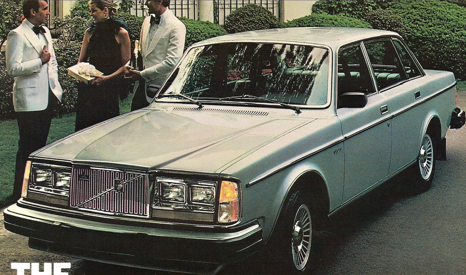
MYSTIC SILVER METALLIC GLE SEDAN.