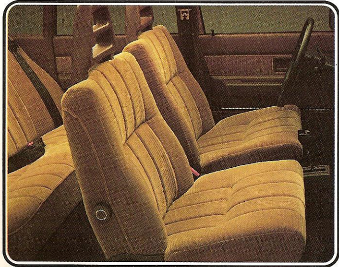
BEIGE VELOUR UPHOLSTERY IS STANDARD ON KINGSMERE GREEN METALLIC GL SEDANS.

The GL sedan is just right for the family that requires the economy of a four-cylinder engine—outward appearances to the contrary.