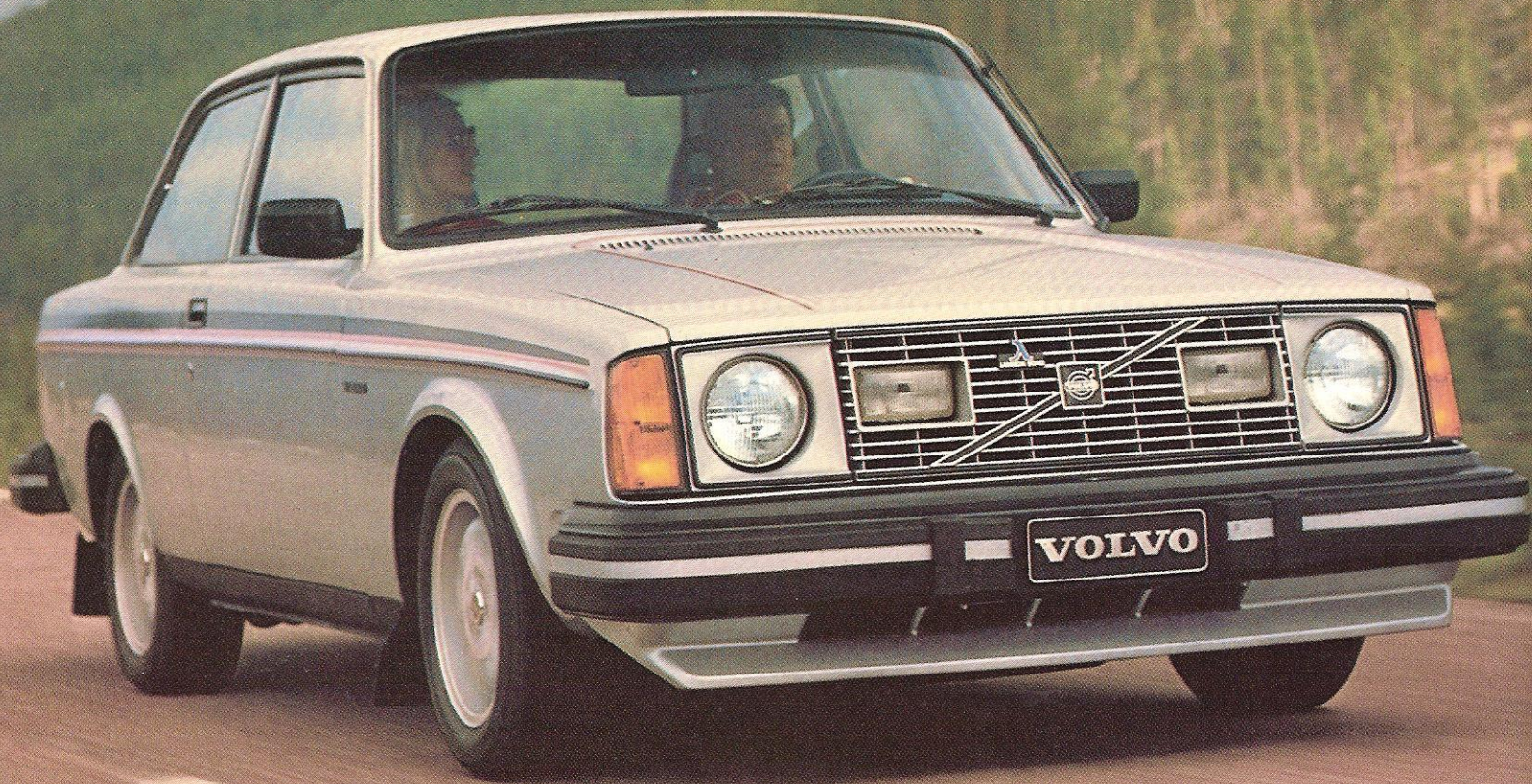
MYSTIC SILVER METALLIC GT.