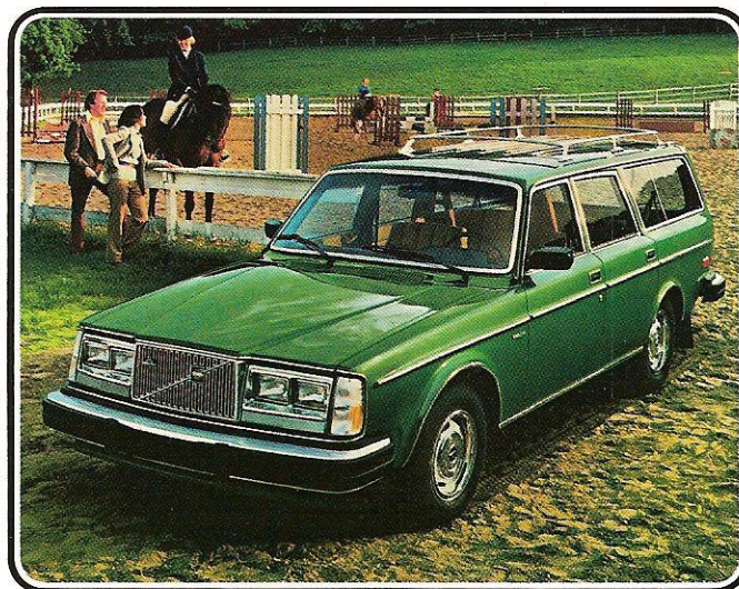
KINGSMERE GREEN METALLIC GLE WAGON WITH OPTIONAL ROOF RACK.

On all Volvo GLE sedans and wagons, luxury is standard; not added on.