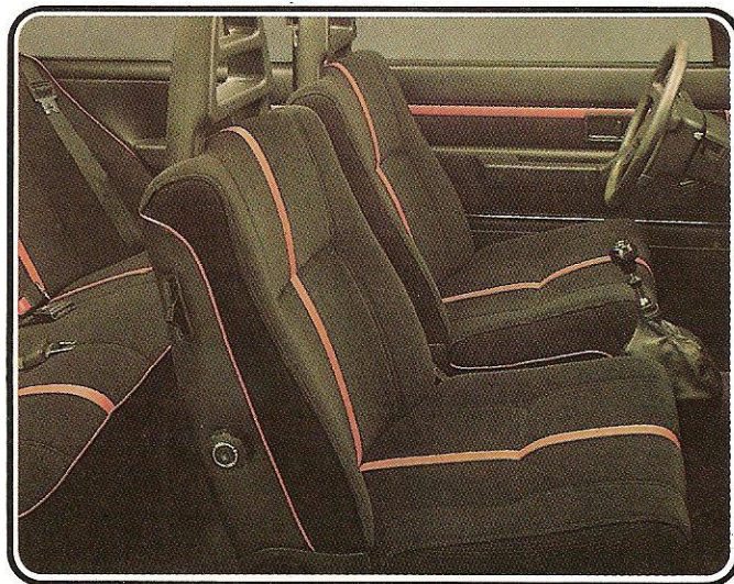
BLACK CORDUROY UPHOLSTERY WITH RED STRIPING.

The Volvo GT can give you an edge on the open road. And you won't have to sacrifice your standard of living to own one—because a Volvo GT won't leave your budget in the dust.